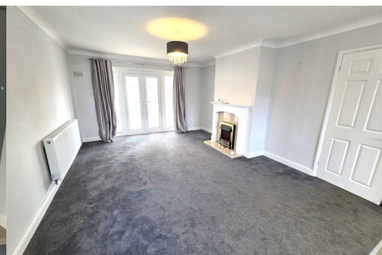
Image has been digitally staged for illustration purposes only